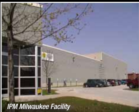
IPM Milwaukee Facility