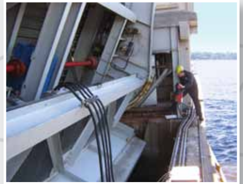
Laser Tracker Measurement of Bascule Bridge