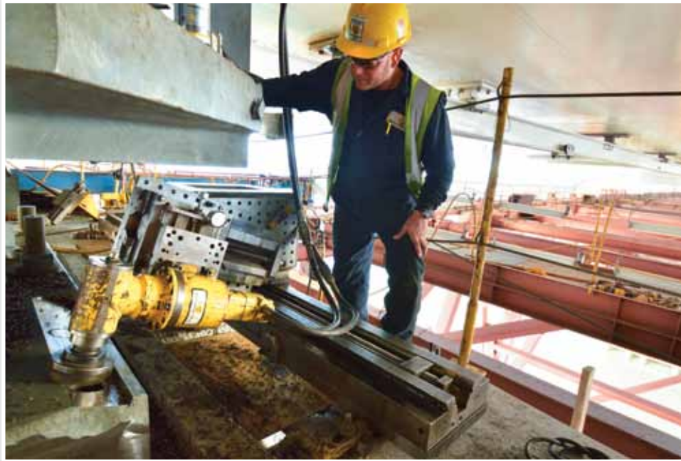
On-Site Repair of San Francisco-Oakland Bay Bridge — Machine Shear Key Baseplates