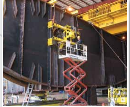
Machine Bridge Girders On-Site