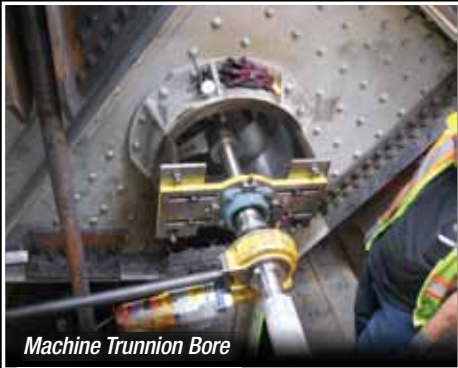
Machine Trunnion Bore