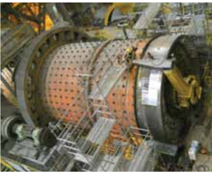
Mining & Cement Producing