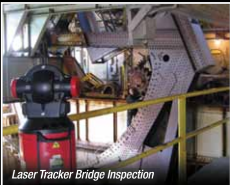
Laser Tracker Bridge Inspection