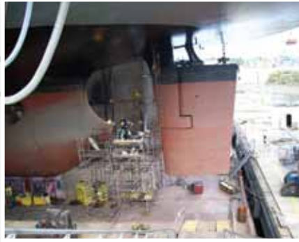
Marine & Offshore