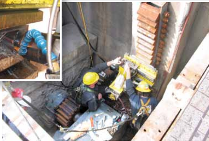
Machine Rack and Pinion Tooth Mesh