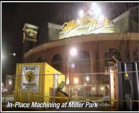
In-Place Machining at Miller Park