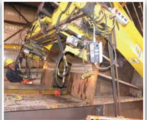
Precision Machine Rolling Bascule Bridge Tread and Track