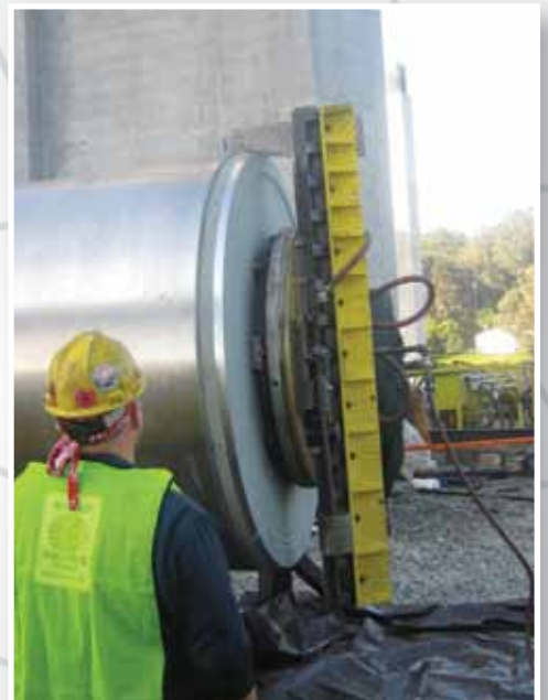
Machine Pipe Beam Spherical Bearing Fit