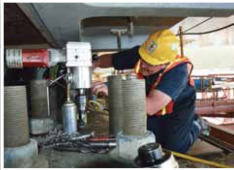
Drill Shear Key Holes