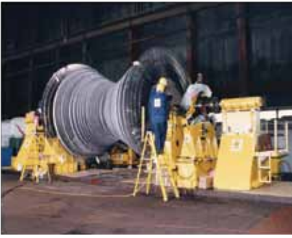
Fossil & Nuclear Power