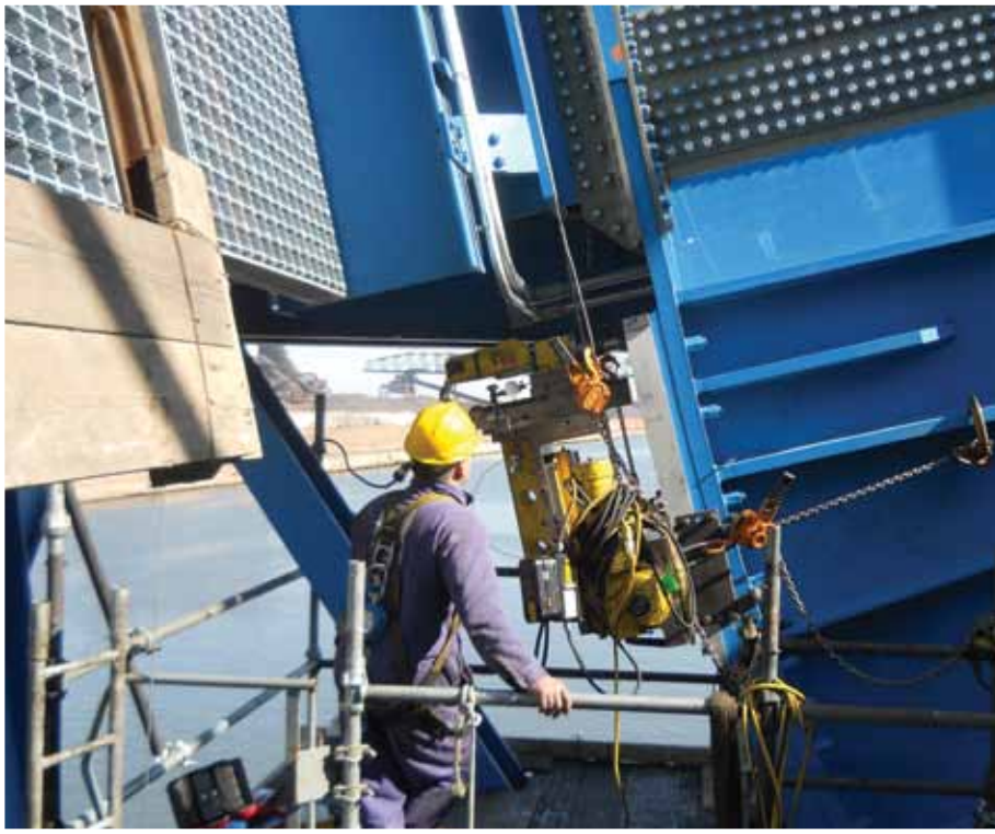
Machine Bascule Bridge Tread Radius