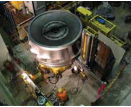
Hydro-Electric & Pumped Storage