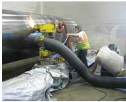
Pulp, Paper & Packaging