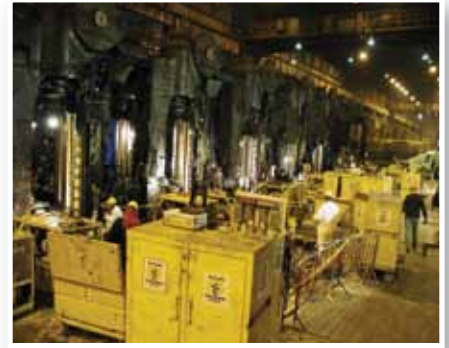
Steel & Metals Producing