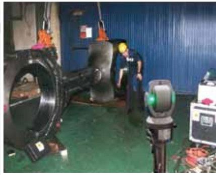
Large Diesel Engine