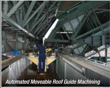
Automated Moveable Roof Guide Machining