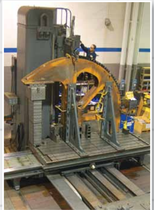
In-Shop Machine Bascule Bridge Girders