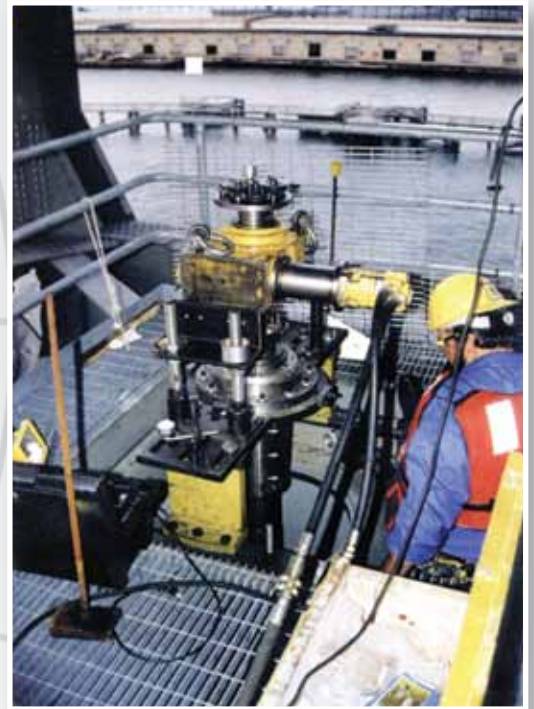
Bore Motor Mount on Bridge