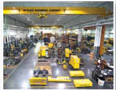
IPM Milwaukee Facility