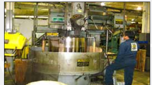
Machining Sleeve at IPM Milwaukee Shop

When the sleeve had cooled, the O.D. was machined to final size and geometry and the drum filter was placed back into service in a matter of days after first arriving onsite. This project's short schedule was made possible by the close communication and careful planning between IPM and the customer.