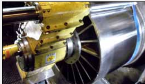
Sleeve After Successful Journal Repair by IPM

IPM engineers immediately set to work designing an onsite bearing journal repair solution while working with the customer to provide a solution that would quickly bring the unit back on line while also promising maximum longevity. The journal repair that was settled upon was to machine away the damaged material and install a large diameter sleeve.