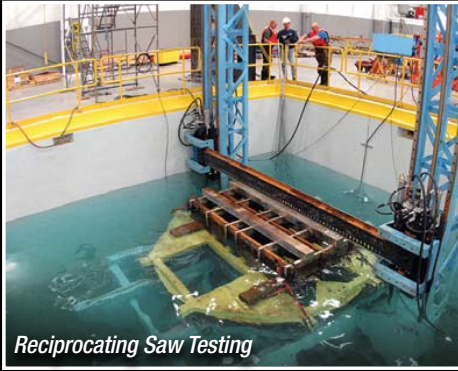
Reciprocating Saw Testing