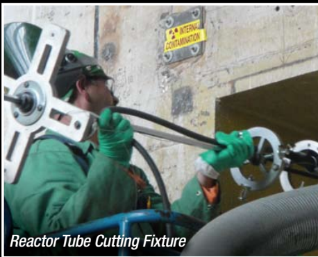
Reactor Tube Cutting Fixture