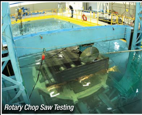
Rotary Chop Saw Testing