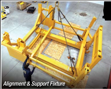
Alignment & Support Fixture