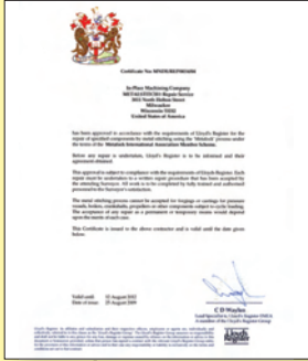
Lloyd's Register Metalstitch® Certification