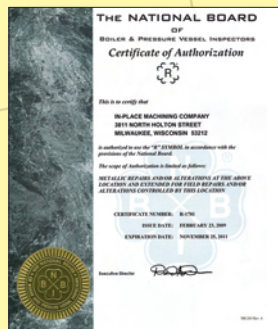
R-Stamp Pressure Vessel Welding Certification