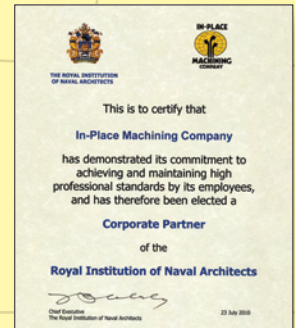
Royal Institution of Naval Architects Certification