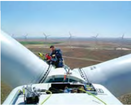
Wind Power Generation