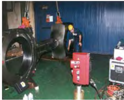
Large Engine Repair