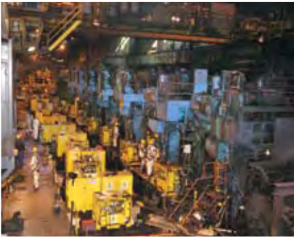
Steel & Metal Production