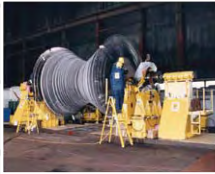
Fossil & Nuclear Power