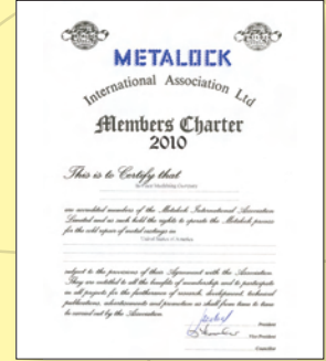
Metallock International Association Membership