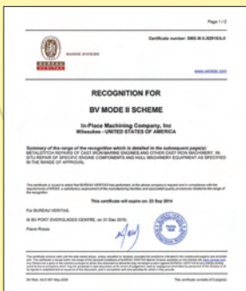
Bureau Veritas Metalstitch® & Engine Repair Certification