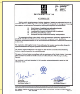
Det Norske Veritas Engine Repair Certification