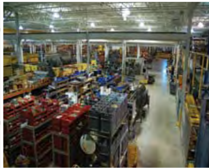
IPM Milwaukee Facility