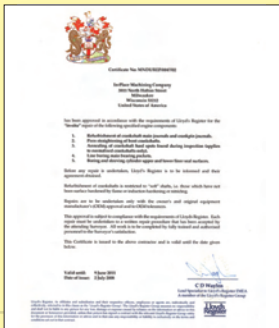
Lloyd's Register Engine Repair Certification