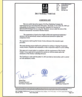
Det Norske Veritas Metalstitch® Certification