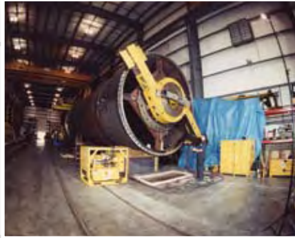
Mining & Cement Industry