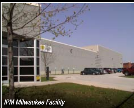
IPM Milwaukee Facility