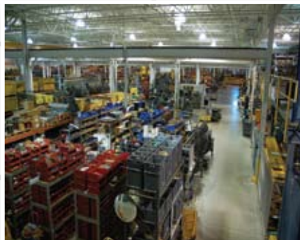
IPM Milwaukee Facility