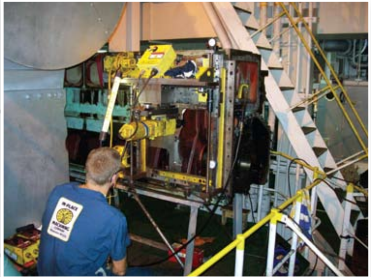
Machine Engine Block Before Metalstitch® Repair