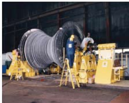
Fossil & Nuclear Power