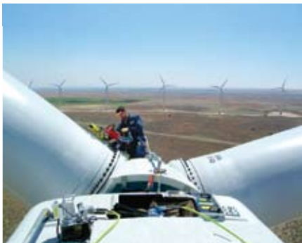
Wind Power Generation