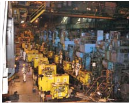
Steel & Metal Production