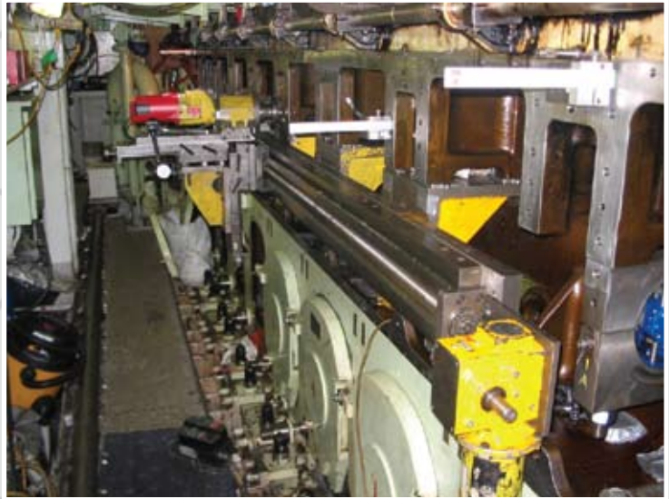
Machine Cam Shaft Bearing Mounting Pads