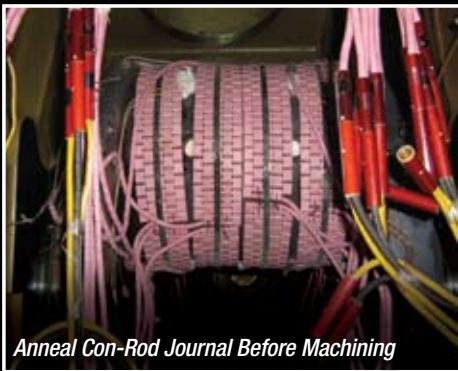
Anneal Con-Rod Journal Before Machining