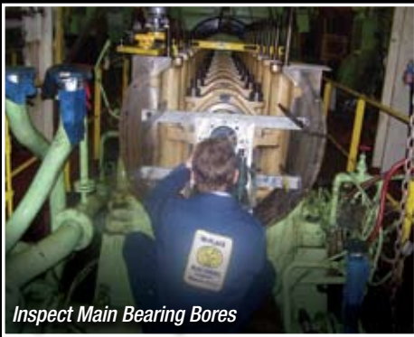
Inspect Main Bearing Bores