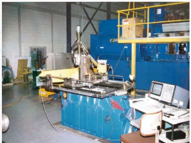
Portable CNC Machine Turbo-Charger Housing Surfaces