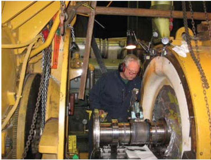
Refurbish Single Bearing Generator Journal & Coupling