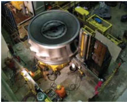
Hydro-Electric Power Generation