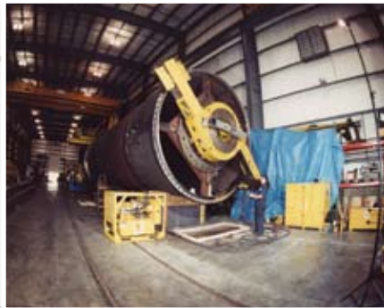
Mining & Cement Industry