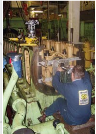
Inspect Engine Block