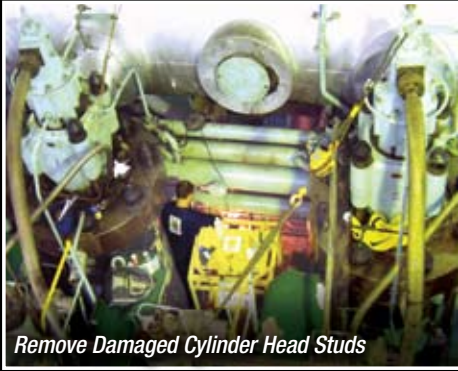
Remove Damaged Cylinder Head Studs