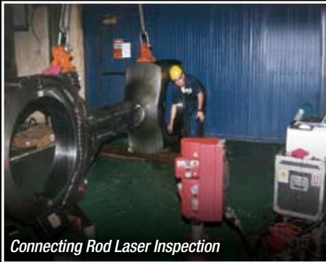
Connecting Rod Laser Inspection