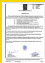
Det Norske Veritas