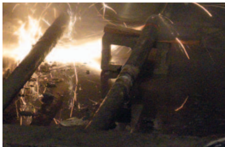
Diamond blades cut through the 1,000-foot, high-tensioned tendons with speed.

Two phases involving the cutting of the east approach piers were completed prior to the major shutdown. Typical pier cross-sections were five feet in width and 40 feet in length. Working from an adjacent temporary pier, Cutting Edge set up diamond wires 190 feet in length, which were transitioned to various cutting heights at 5-foot intervals during the course of the cutting work. The cutting contractor completed these two phases on time so that cutting of the pontoons and tendons could begin on the day of the shutdown. The majority of the cut pier sections were lifted out prior to the shutdown, however some remained