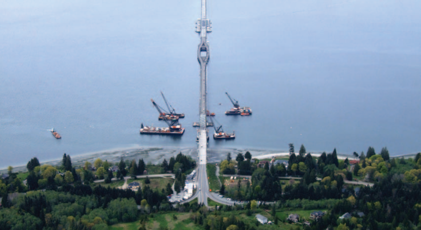
Aerial view of the Hood Canal Bridge during the course of the work.

Cutting Edge worked very closely with the general contractor to identify significant design considerations and special precautions required for the pontoon separations, including the sequence of cutting, a plan for the stabilization of the bridge and the close monitoring of below-sea-level confined space work. In addition to standard items of personal protective equipment, all workers had to wear flotation vests.