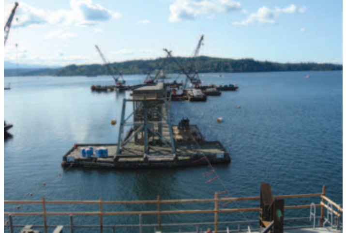
Some of the pontoon sections were as long as three football fields.

In addition to the weather conditions above water level, working inside concrete cells below sea level involved extra risk for the cutting