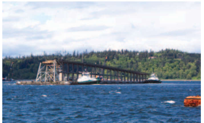
The cut pontoons were towed north to be reemployed as floating piers.

team and created a need for confined space monitoring and strict safety procedures. Potential dangers included the significant failure of the pontoon separation, which could have sunk several pontoons during the works.