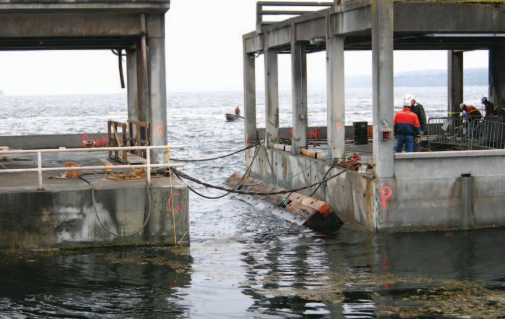
The bridge pontoons were joined by 3.5-inch tendons and 1.5-inch bolts.