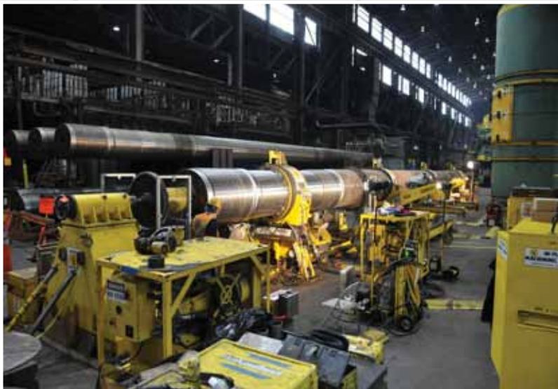
Forging Press Tie Rod Machining with Portable Lathe