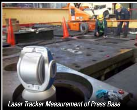
Laser Tracker Measurement of Press Base