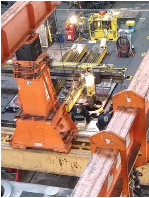
Machine Forging Press Base Crown, Side Frame Crankshaft, & Backshaft Bores