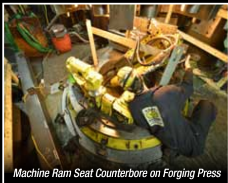
Machine Ram Seat Counterbore on Forging Press