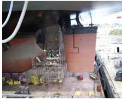
Marine & Offshore