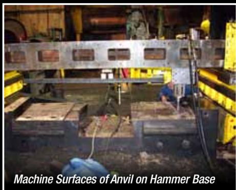
Machine Surfaces of Anvil on Hammer Base