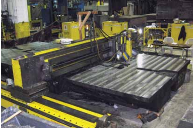
Die Holder Machining