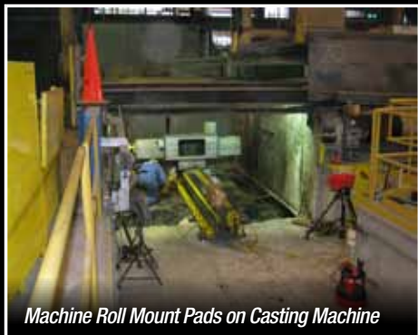
Machine Roll Mount Pads on Casting Machine