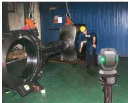
Large Diesel Engine