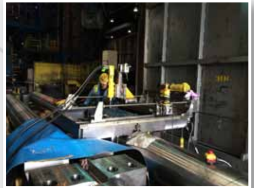
Pushback Rod Machining