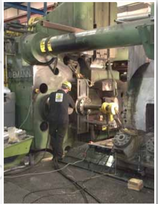
Machine Pressure Ring Bore on Extrusion Press