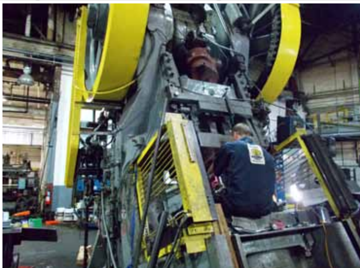
Bore & Counterbore Ejector Pin Bore on Stamping Press