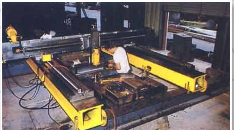
Sow Pocket Machining