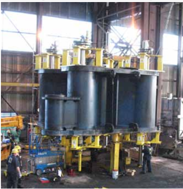
Upper Platen Machining