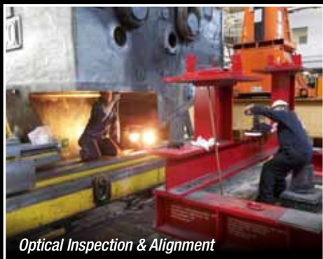
Optical Inspection & Alignment