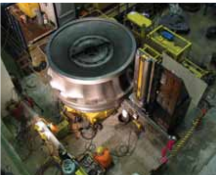
Hydro-Electric & Pumped Storage