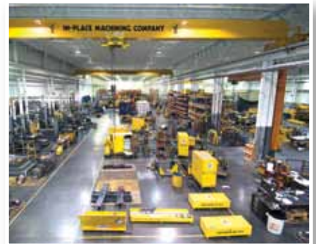
IPM Milwaukee Facility