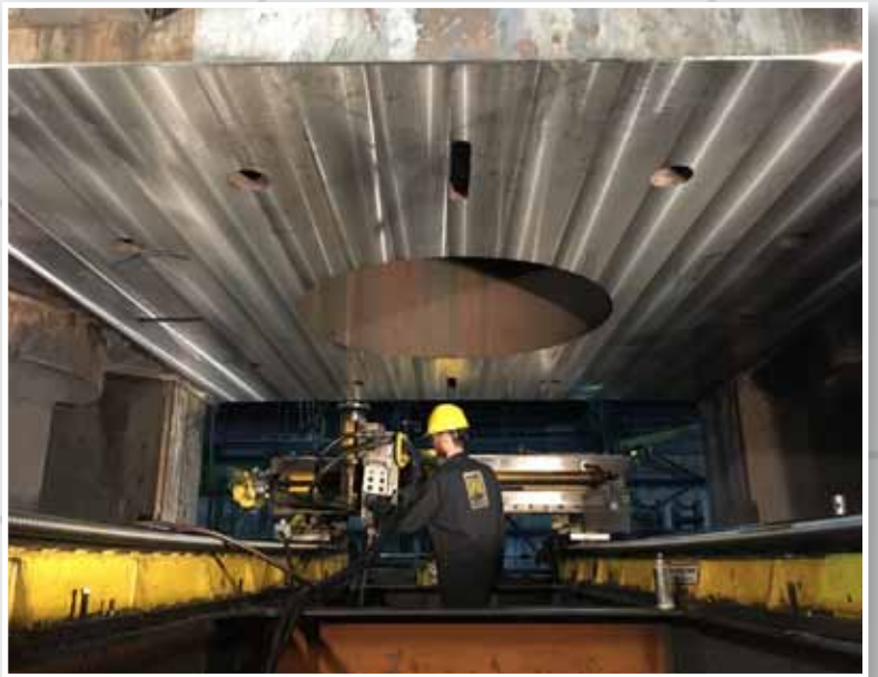
Upper Moving Platen Machining