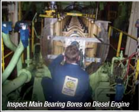
Inspect Main Bearing Bores on Diesel Engine