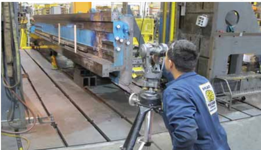
Optical Inspection of Gantry Mill Ways