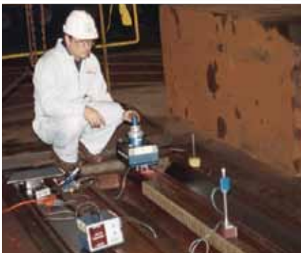
Laser Straightness Check of Roll Grinder Ways