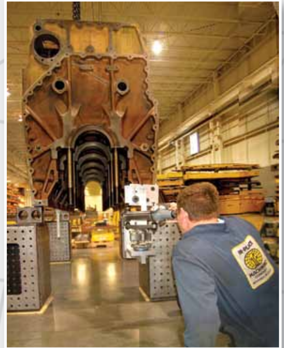
Optical Inspection & Alignment of Engine Block