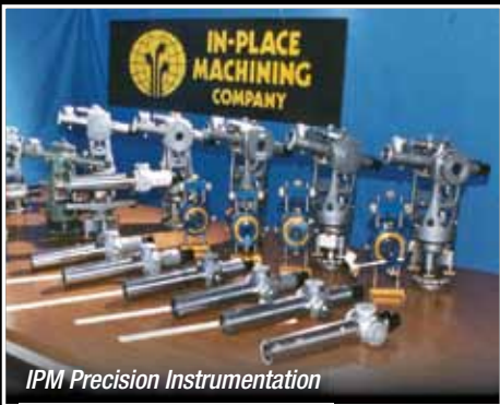
IPM Precision Instrumentation