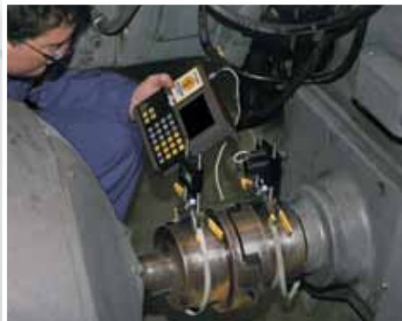
Laser Alignment of Motor Couplings & Gearbox