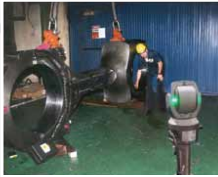
Large Diesel Engine