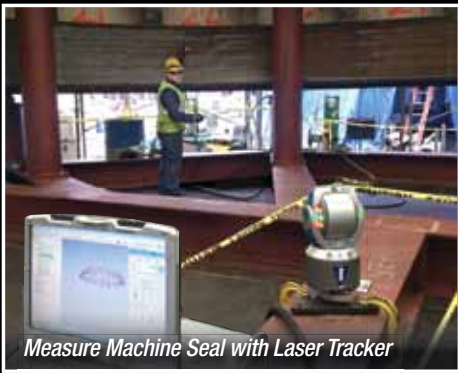
Measure Machine Seal with Laser Tracker