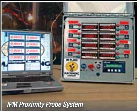
IPM Proximity Probe System