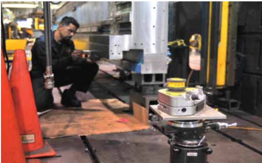
Laser Alignment of Gantry Mill Ways