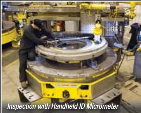
Inspection with Handheld ID Micrometer