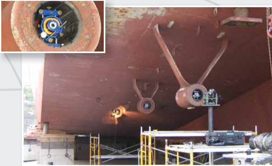
Inspect Alignment Between Propeller Strut Bores on Marine Vessel