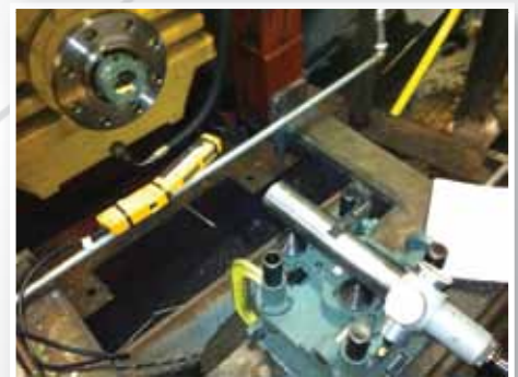
Optically Align Shaft Couplings