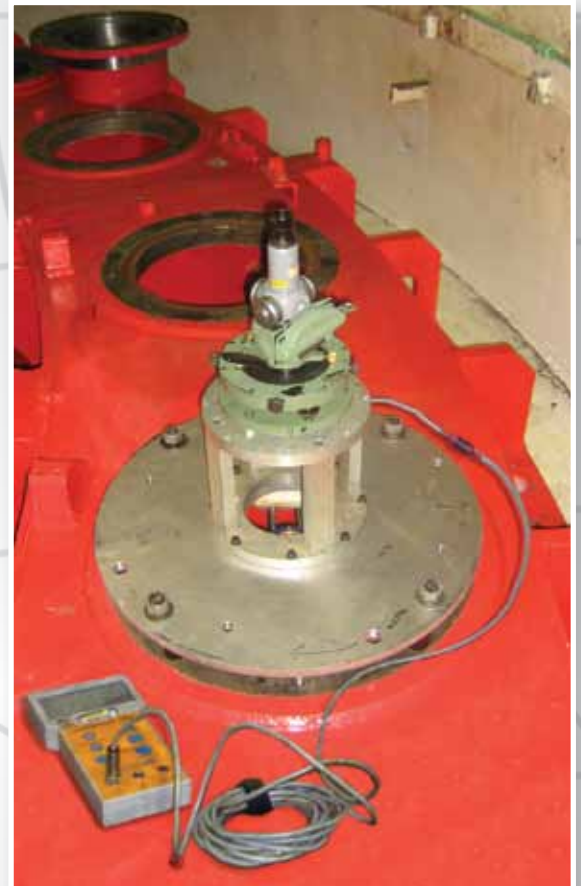
Wicket Gate Line Bore Inspection with Optics & Electronic Level