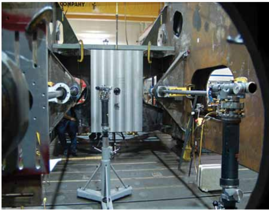
Measure Complex Geometry with Multiple Optical Devices