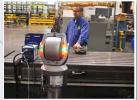
In-Shop Testing of Laser Tracker