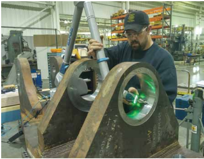
Portable Coordinate Measuring Machine (CMM)