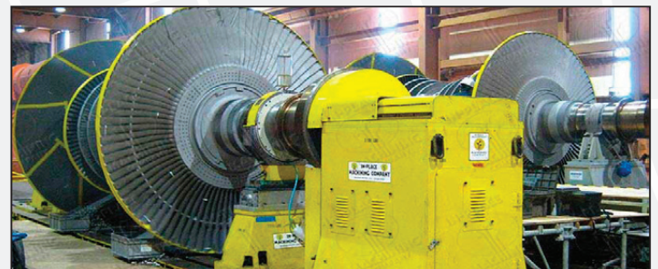
Field Machining: Portable Lathe Blade Root Modification on LP Rotors

Call Us Today — For more information on our new location and what we can do for you, Call IPM Pacific Northwest Today at 360-787-7993 or visit inplace.com .