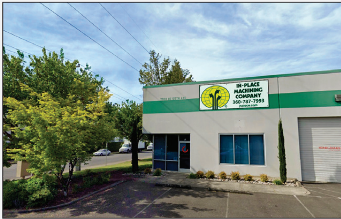
IPM's Pacific Northwest Division Expands Field Machining

In-Place Machining Company's field machining services , on-site measurement & alignment , and certified on-site welding are now supported by our new Vancouver, Washington location to better support our customers. An industry pioneer, IPM is a world recognized leader in precision on-site field machining, milling, boring, drilling, and refurbishment work.