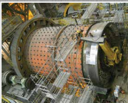
MINING & CEMENT PRODUCING