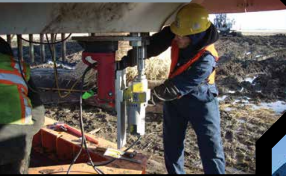
REPAIR DAMAGED WIND TOWER HOLES ON-SITE