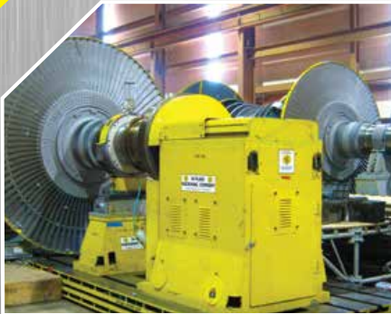
THERMAL & NUCLEAR POWER