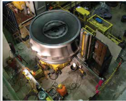
HYDRO-ELECTRIC & PUMPED STORAGE