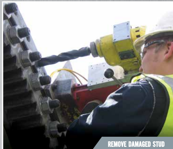
REMOVE DAMAGED STUD