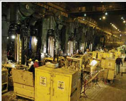
STEEL & METALS PRODUCING