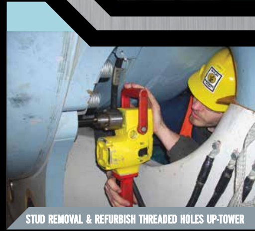
STUD REMOVAL & REFURBISH THREADED HOLES UP-TOWER