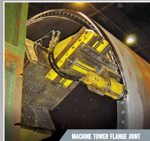
MACHINE TOWER FLANGE JOINT

QUALITY MACHINING IN-PLACE... ANY PLACE IN THE WORLD