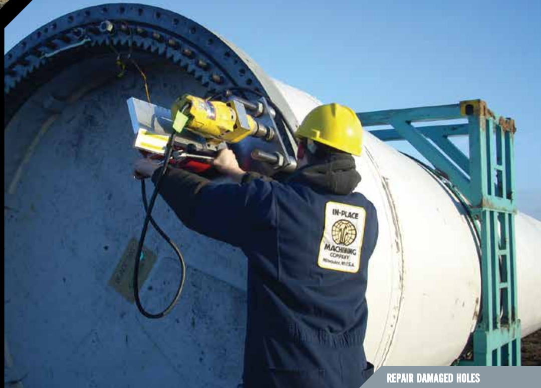
REPAIR DAMAGED HOLES