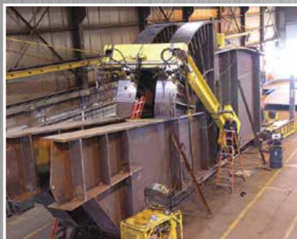
BRIDGE & INFRASTRUCTURE REPAIR