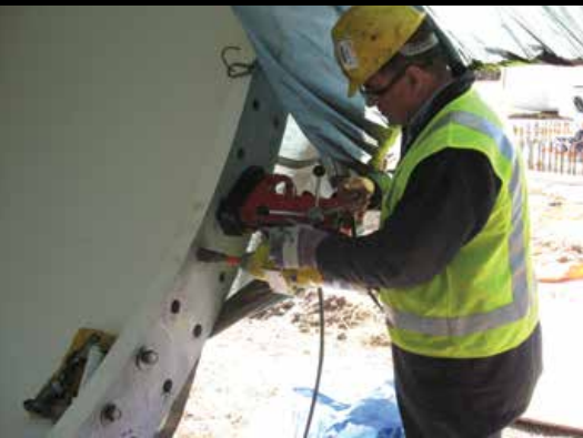
TOWER FLANGE MACHINING