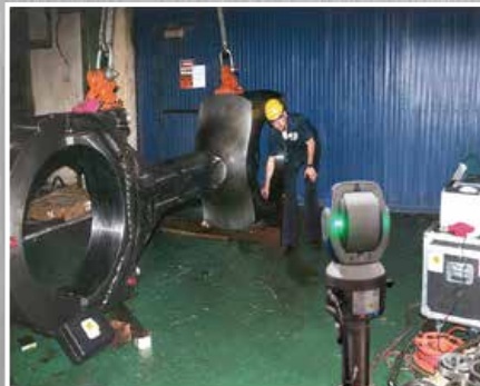
LARGE ENGINE REPAIR