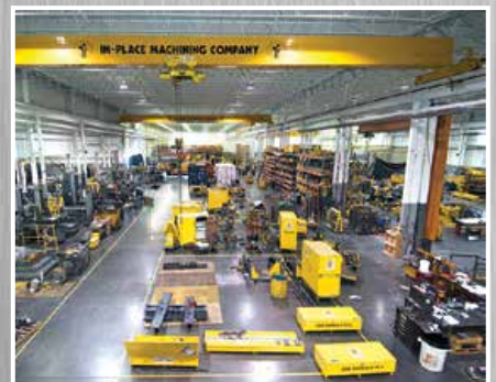
IPM MILWAUKEE FACILITY