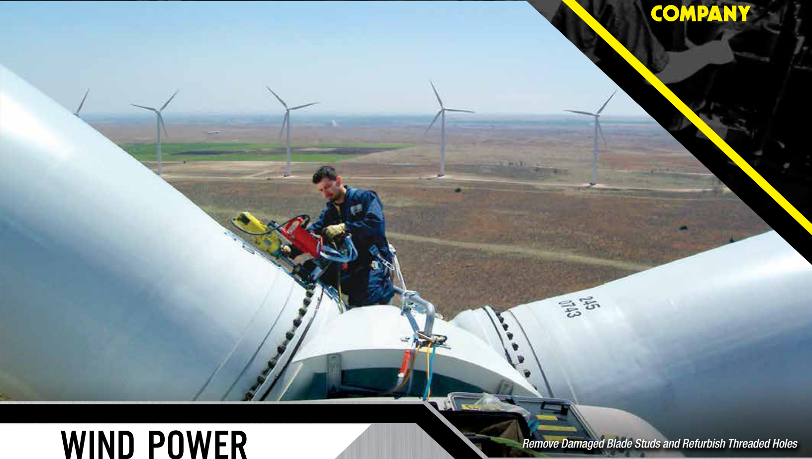
Remove Damaged Blade Studs and Refurbish Threaded Holes