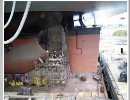
MARINE & OFFSHORE