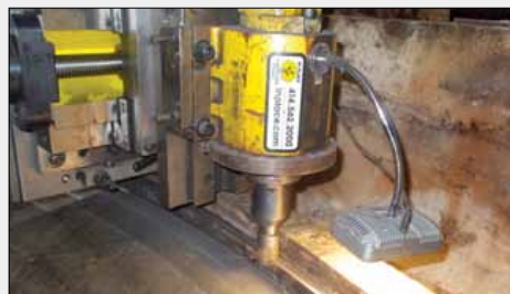
Precision Milling and Boring of Retaining Ring Fit

the surface. Despite the additional stock removal needed, all work was completed on schedule. This allowed for the repairs to be completed during the