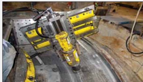
Grinding Table Liner Seat Area Repair

was performed with no modifications to the table for equipment attachment, allowing for exceptionally fast setup and alignment, on-site . All field machining equipment used to perform the work was designed and manufactured by IPM. Due to the amount of wear and previous weld repairs, over a 1/4" of material was removed from