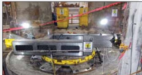
Field Machining Equipment Installation and Alignment

M issouri — In-Place Machining Company innovates again! Tasked with refurbishing the liner seat surface on a Combustion Engineering cement mill grinding table, IPM successfully machined, on-site, the 14-foot diameter cone shaped surface to OEM specifications. Work