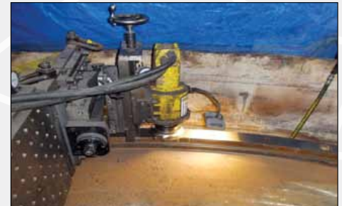
On-Site Milling of Bolting Flange

planned outage. In-Place Machining Company's field machining technicians worked 24 hours a day until project completion. In conjunction with the liner seat machining , IPM also repaired a series of drilled and tapped holes. Cement manufacturing facilities worldwide depend on In-Place Machining Company to perform the most demanding, high tolerance, precision field machining projects.