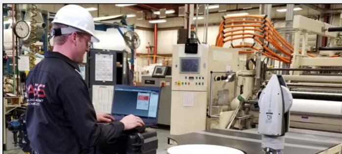
Laser Tracker Captures Roll Alignment Data