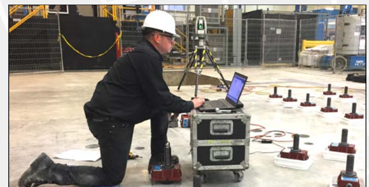
OASIS Metrology Engineer Accurately Maps Data for Layout Work

With the acquisition of OASIS Alignment Services, all IPM customers will not only benefit from expanded precision field services, but closer proximity to these services from eighteen locations in the U.S. and Canada.