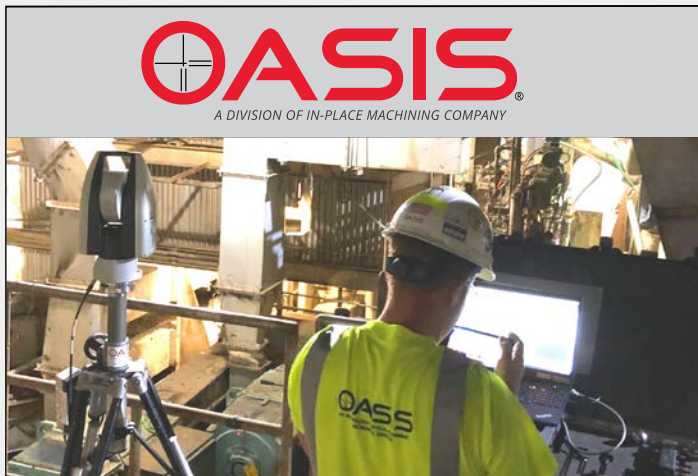
OASIS Engineer Inspects Component Alignment at Paper Mill

In-Place Machine Company, LLC (IPM) is pleased to announce the acquisition of OASIS Alignment Services, LLC (OASIS) as part of a long-term growth strategy to expand reach and service offerings to customers and prospects across the U.S. and Canada. A globally recognized precision field machining company, IPM has long been the leader in onsite machining, diamond wire cutting, and industrial measurement services. Adding the experience, knowledge, and precision measurement and machine alignment capabilities of OASIS, increases IPM's growing measurement and alignment division , and exponentially enhances the benefits to customers across multiple industries.